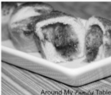
Around My Family Table