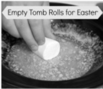
Empty Tomb Rolls for Easter